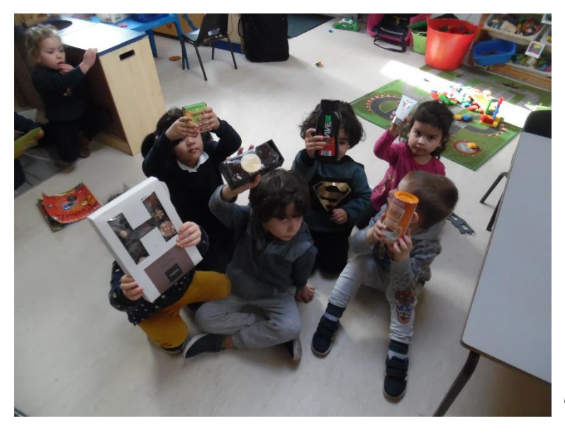
Food Bank SW