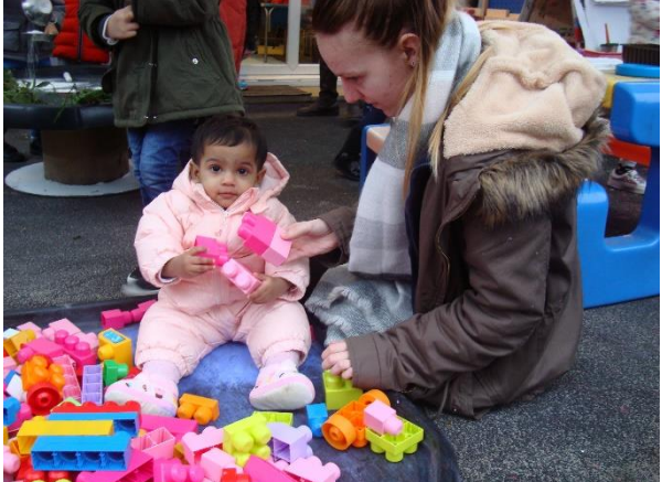
Garden Time Garden Time