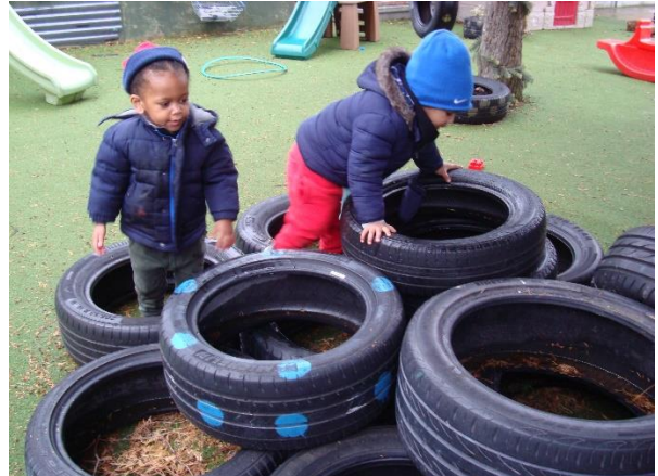
Garden Time Garden Time