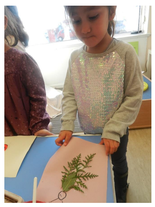
Mini Beast Activity