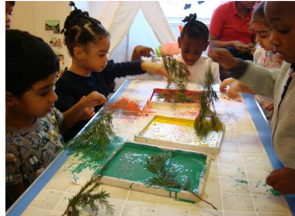
Painting with Leaves