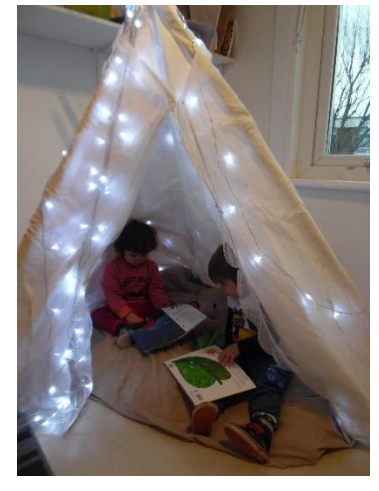
Clever Cats Crawling Caterpillar