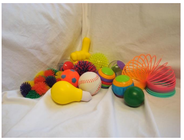
Owl Babies Sensory Bag