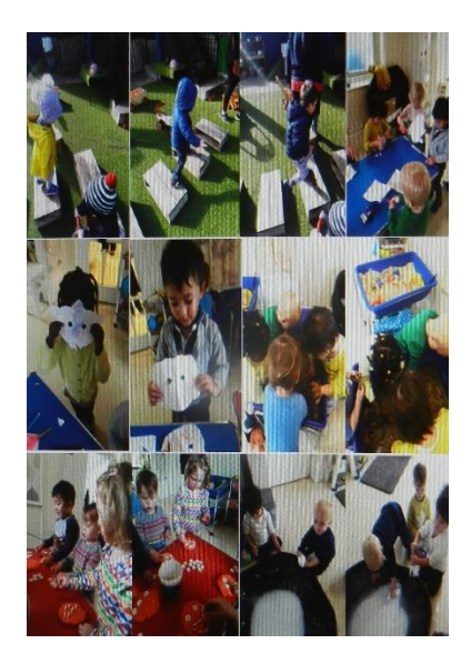
Rainbowfish SW Stingrays SW Sharks SW