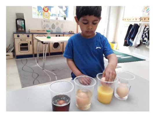
Egg Experiment SW