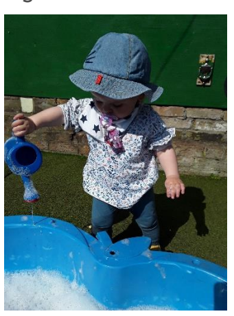
Water Play SW