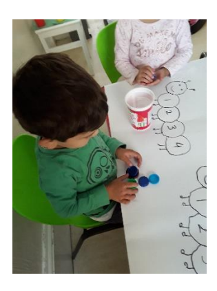
'Caterpillar bingo' SW

"Here is 1 mummy caterpillar" - Frederika