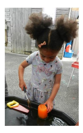
Exploring ice with real tools GH

The children in Stingrays room South Woodford budding gardeners this week, and have planted cress seeds. The children were taken through the process and were able to add the soil and also the seeds. This high level of involvement in such an activity helps children develop their own understanding of the world, particularly growth, change and decay. The physical action of planting the seeds also develops the fine motor skills of the children, as they are required to be accurate with the mud and seeds. Cress is perfect to use for this activity, because of its rapid growth. Why not try at home!