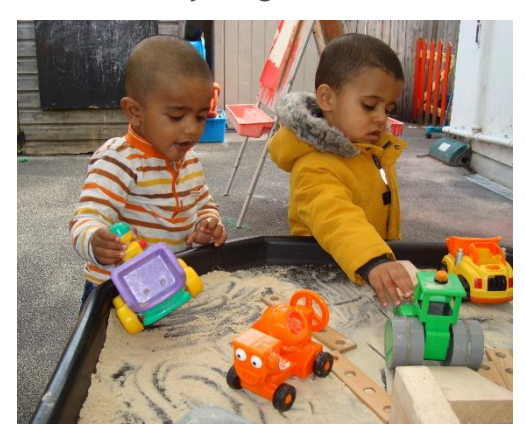
Malleable construction GH

through manipulation. The older children have been playing with a construction site and the younger children have been exploring moon sand.