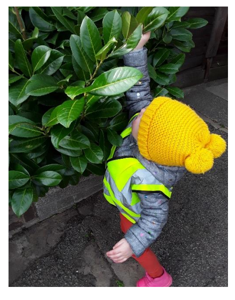
Collecting Leaves SW

"Yellow wow" - Wren "Green leaf" - Francis