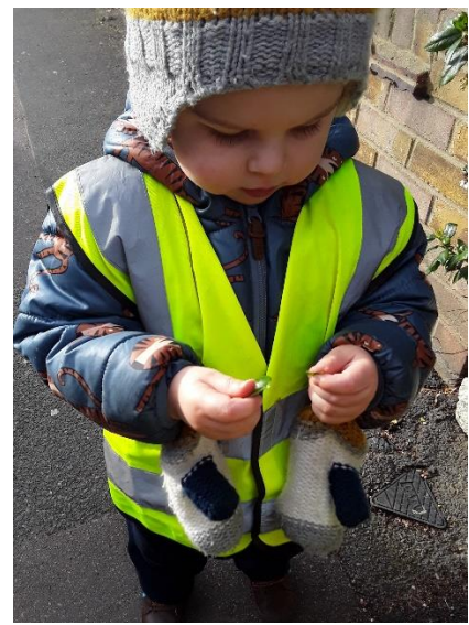
Collecting Leaves SW