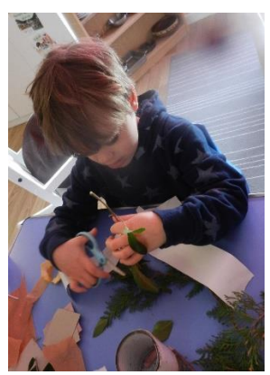
Natural Collage GH

The children in Starfish room South Woodford have been developing the skill of prediction. They were asked about a variety of resources and how they predicted the resource to behave when placed in water. The children were thoroughly engaged and enjoyed investigating whether their predicted theories were correct. This type of activity develops skills in a variety of areas of earning within the EYFS, such as, 'Communication and Language' and 'Understanding the world'.