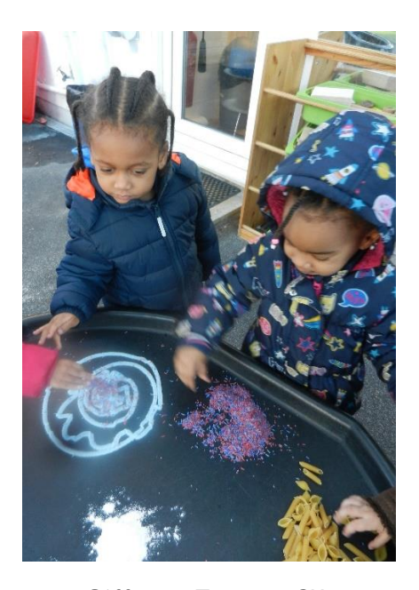
Different Textures GH

The children in Stingrays room South Woodford have exploring the local environment and collected leaves to create their own collages and artwork. The children went on a small outing with the practitioners and they collected some natural resources. The children enjoyed this process in its entirety, and practitioners used language as to support them. In allowing the children the opportunity to be involved in the gathering of the resources, they are then highly motivated to participate fully, and thus more likely to achieve the learning intentions of the activity itself.