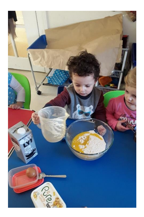
Making Pancakes SW

The children at Gants Hill the children have have been using the natural resources from the garden the children have created their pictures to support their learning. Some children have made spiders, some made grasshoppers and some making lady birds. Within the EYFS it states that children should 'show care and concern for living things' by carrying out these activities it introduces these concepts to the children. To extend the learning children are also encouraged to label their work with their name, this enhances literacy development and gives children encouragement to form letters correctly.