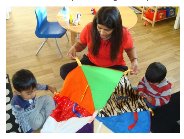
Sensory Parachute GH

The children at Gants Hill the children have been playing with the sensory parachute. This activity promotes so many areas of learning whilst the children are having so much fun. This form of play encourages a variety of different skills. By coordinating the parachute together, children learn about cooperative play and communication, along with taking turns and learning to follow instructions. Repetitive motion and using songs helps with developing a sense of rhythm, which in turn can help with cognitive process.