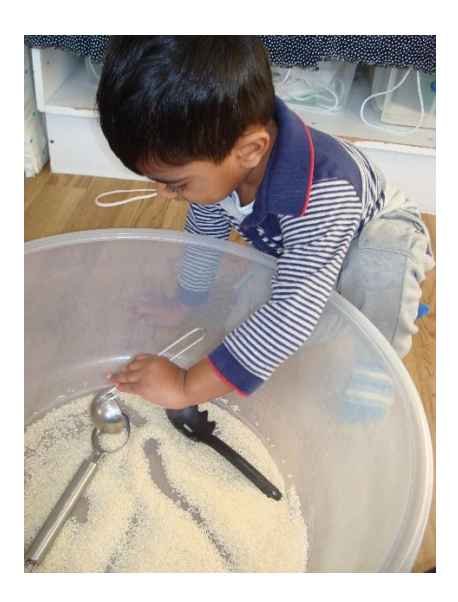
Rice Play GH

The children in Sharks room South Woodford have been exploring raw broccoli. This sensory activity ignites an interest from the children as this is their main method of learning. The children are able to develop their fine motor skills, as manipulating the resources improve dexterity to help with their pre-writing skills. This activity also introduces and promotes healthy eating with the children.