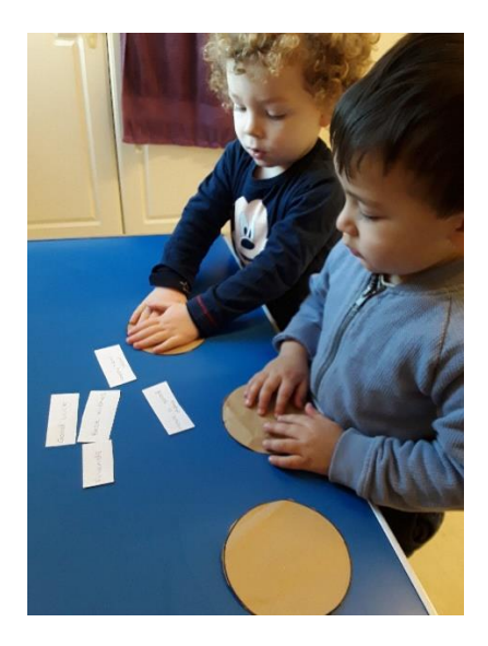
Fortune Cookie GH

The children at Gants Hill the children have been playing with rice. Rice play uses all 5 senses, but the sense of touch is often the most frequent. This activity also encourages children to manipulate and mould materials, building up their fine motor skills and coordination. These Sensory activities facilitate exploration and naturally encourage children to use scientific processes while they play, create, investigate and explore.