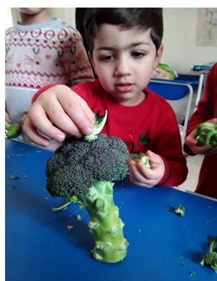
Exploring Broccoli SW

The children at Gants Hill the children have been exploring colour by participating in large scale painting in the garden. There were many benefits to this activity.