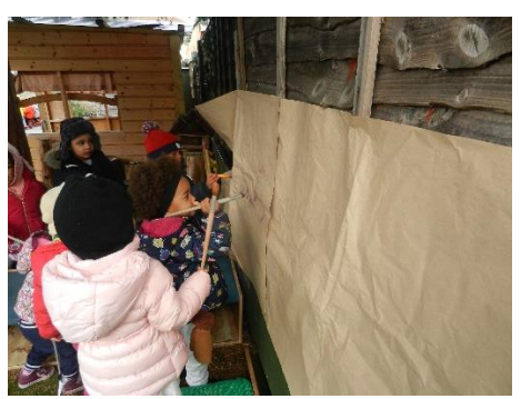
Large Scale Painting GH