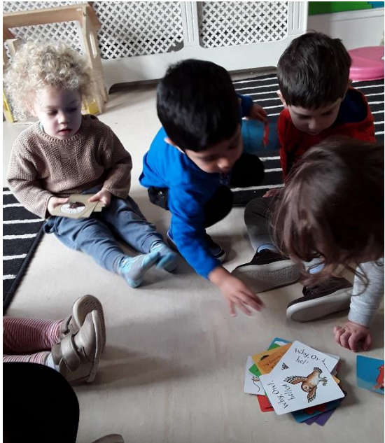
The Gruffalo SW