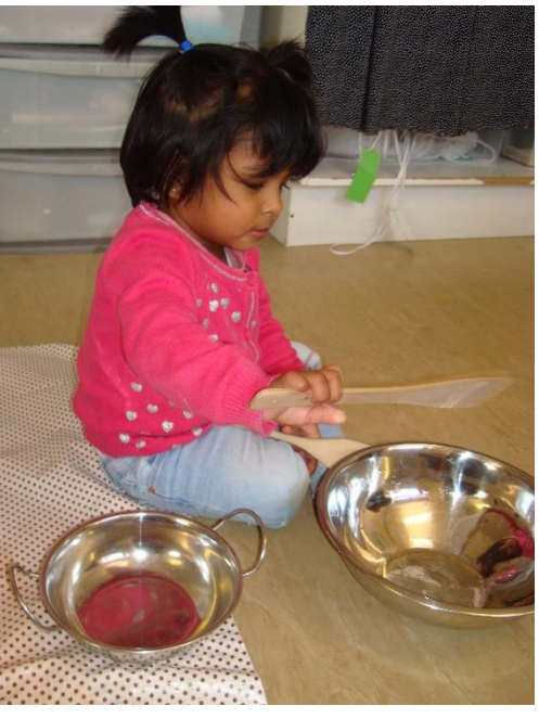
Making Music GH