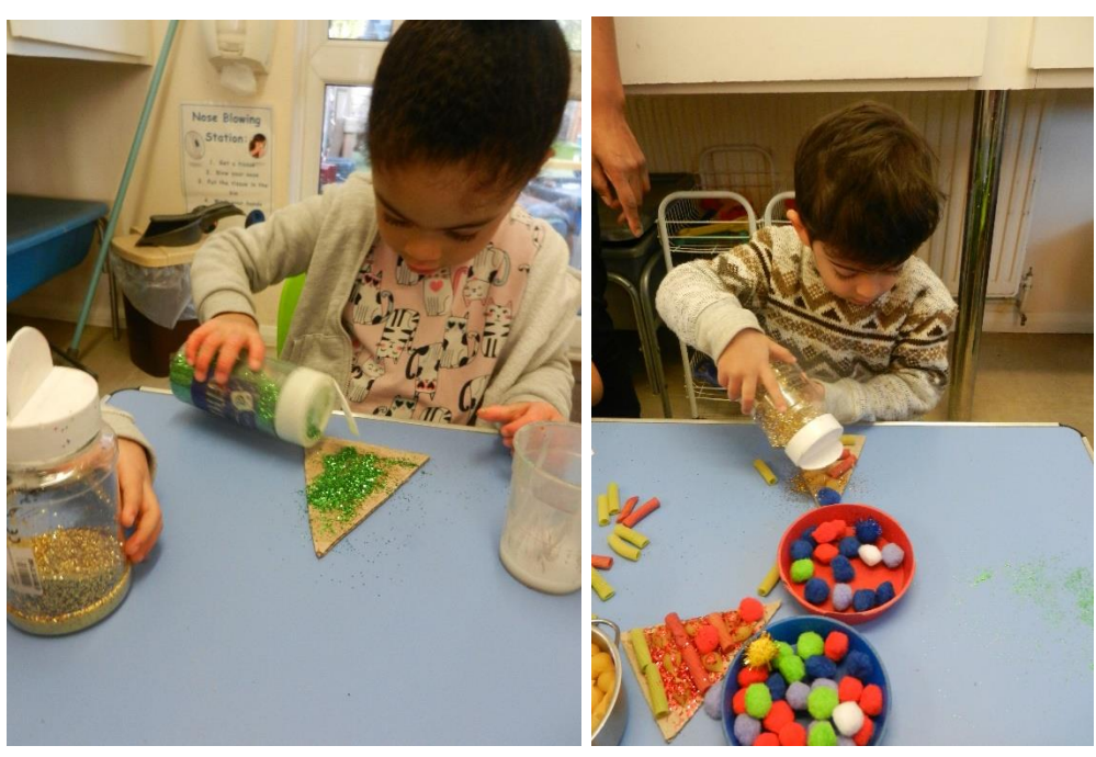
Christmas Trees GH

In Gants Hill the children have been decorating Christmas trees. This activity encourages fine motor skills, neural development, and problem-solving abilities and that it can be used effectively to teach and understand other key subjects such as reading, writing, maths, and science. This activity requires and encourages increasing amounts of dexterity and coordination, yet they are so fun and rewarding that children want to do them over and over.