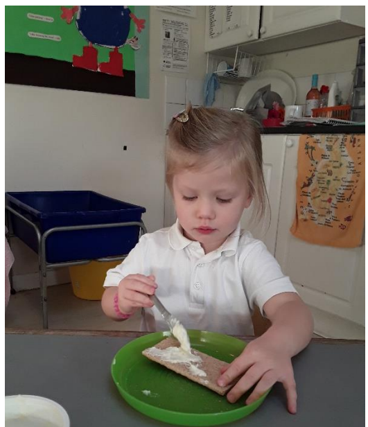
Making Tea SW