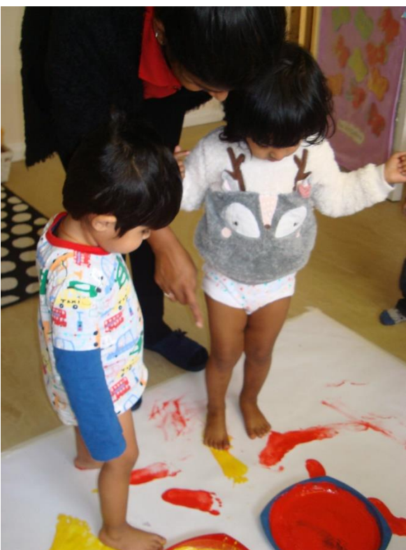
Feet Printing GH