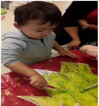
Christmas Tree SW