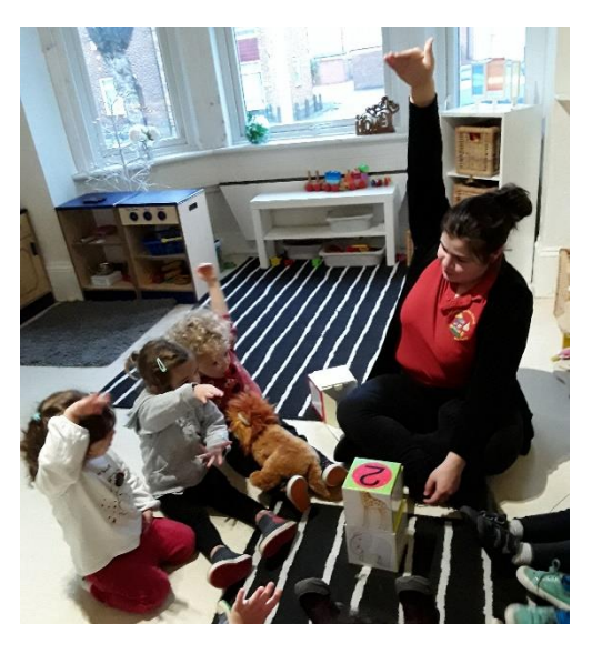
'Dear Zoo' SW

In Gants Hill the older children have been using real tools as part of their play this week. This play is always done with the supervision of adults. This play is called tinkering and for many children it fuels their natural curiosity about life. Tinkering during play teaches the children valuable lessons such as helping develop fine motor skills which then reinforce emerging literacy skills, problem solving abilities, and peer relationships. This play offers vast communication opportunities for all. Both the boys and girls have been fully engaged within the play.