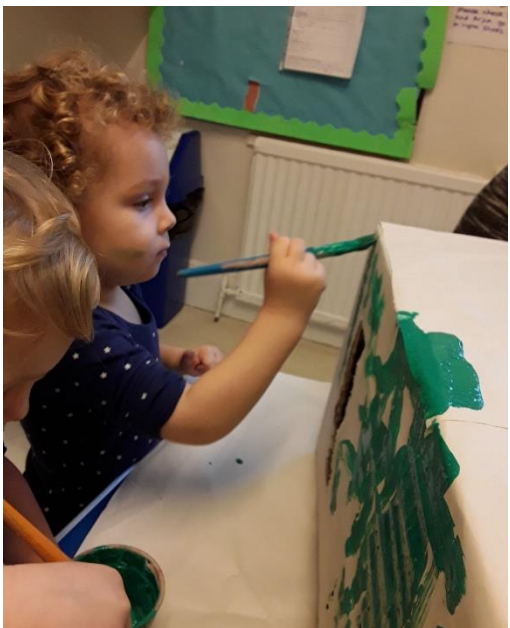
Post box SW