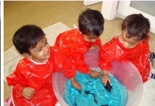
Water Play GH

The children in Sharks room South Woodford have been using their senses to explore the sight, smell and taste of oranges and lemons. This sensory activity helps children to develop a more extensive vocabulary as there are words specific to describing the sight, smell and taste of the citrus fruit. The children used a manual juicer to squeeze juice from the fruit, a practice which develops the muscles of the fingers, hand and wrist. The children then drank the juice they had extracted.