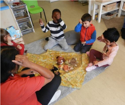
Singing with props GH

The children in Stingrays room South Woodford have been creating a post box for them to post their letters to Santa! They used paint and other resources to collectively create the post box. This type of activity helps the children to negotiate turn taking and understanding of others joining in. The children all thoroughly enjoyed getting the box ready for their very own letters, with Wren saying "Wow" when it was complete.