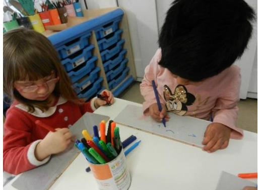
Writing on tiles GH