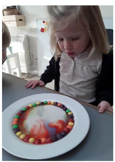
Mixing colours SW