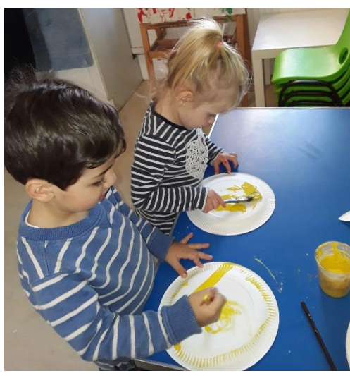
Pudsey Bear SW