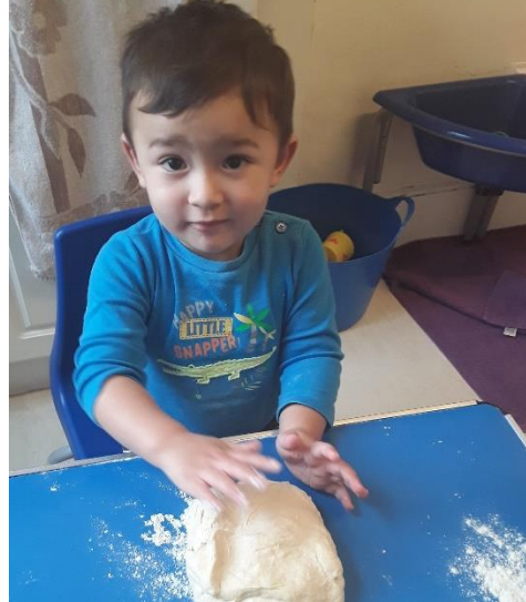
Making Playdough SW