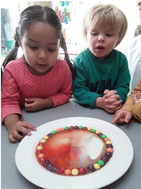
Mixing colours SW