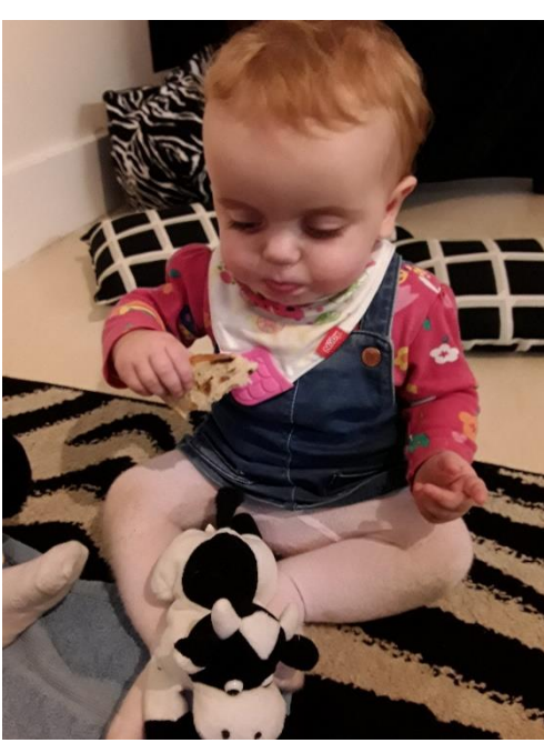
Teddy Bear Picnic SW