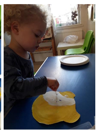
Pudsey Bear SW