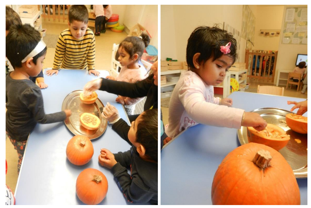
Exploring Pumpkins GH