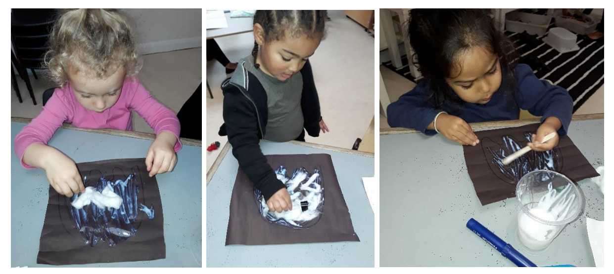
Making Ghosts SW