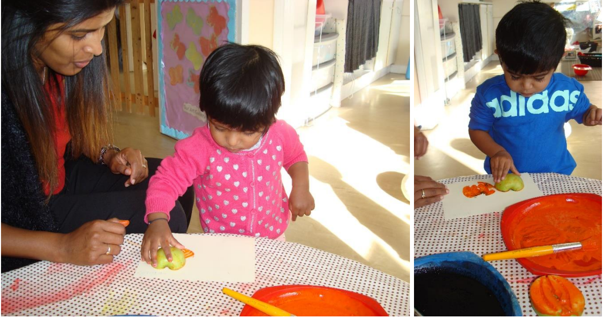
Pumpkin Printing GH

In Gants Hill this week the children have been making pumpkin pictures. The children have used fruit to enhance their painting experience. They used a variety of fruit to provide a more sensory way to create pictures and explore the texture of the paint. This also encouraged the children to interact within a small group, thus developing their personal, social and emotional skills. This creative activity has enabled the children to engage with a sensory form of making marks with a desired effect.