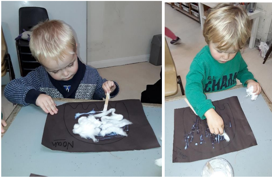
Making Ghosts SW