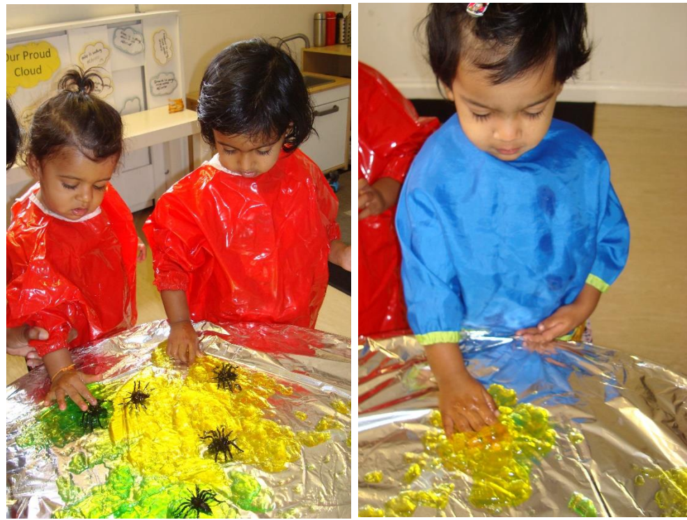
Spiders in Jelly GH