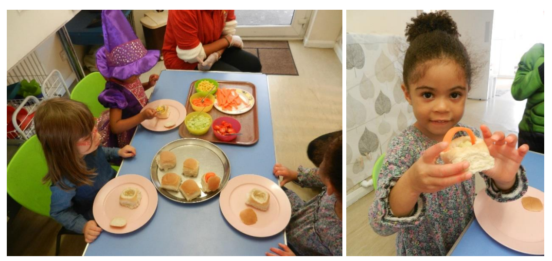
Bread Cauldrons GH