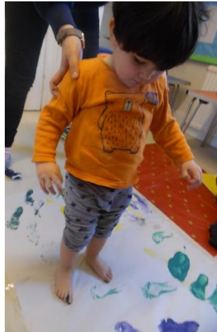
Foot Printing SW