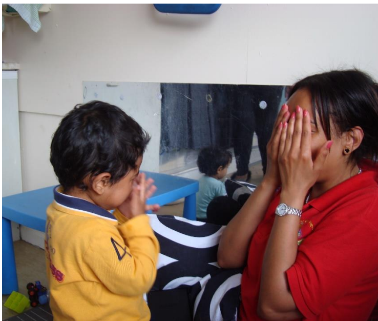
Peek A Boo GH