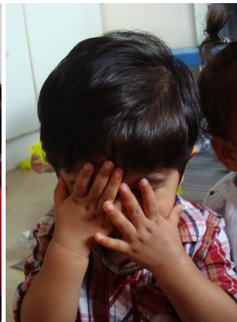
Peek A Boo GH

The children in Starfish in South Woodford have been talking about perception (close by and far away) the children have been using binoculars to help extend their learning.