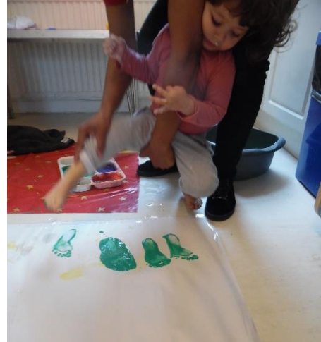
Foot Printing SW

In Gants Hill the children have been embracing the 'transport' topic and have been decorating their own buses. The children have used a number of materials to create their buses. The children used glue with red collage items and buttons for the children to use as wheels. This activity has helped the children to extend their fine motor skills and their hand eye coordination.