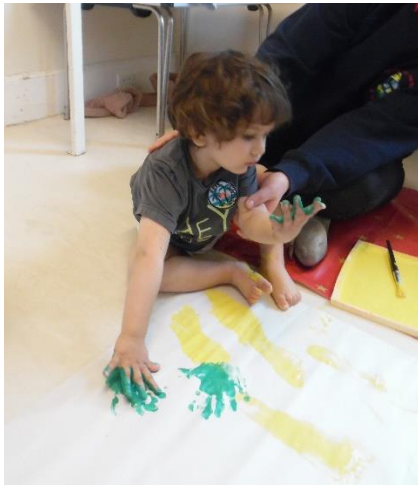
Feet Printing SW