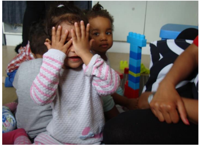
Peek A Boo GH