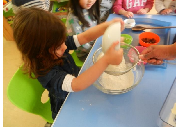
Welsh Cakes GH