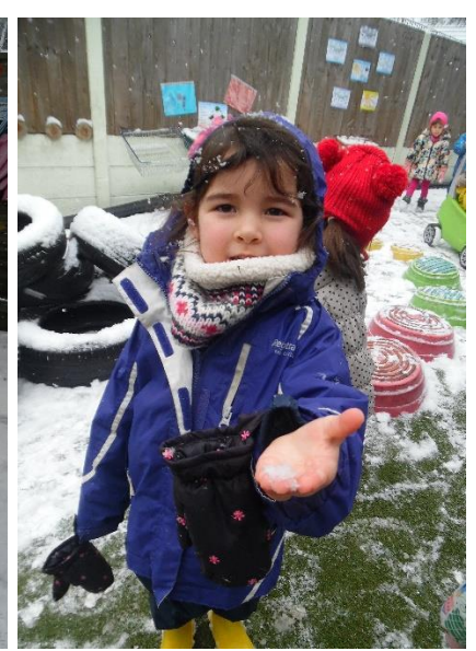
Snow! GH Snow! GH Snow! SW