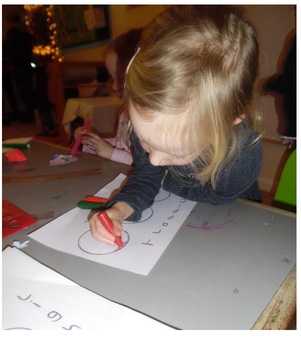
Road Safety SW Road Safety SW