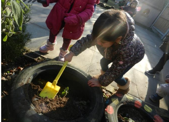
Gardening GH Gardening GH