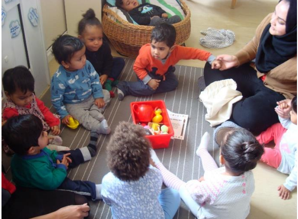
Song Box GH