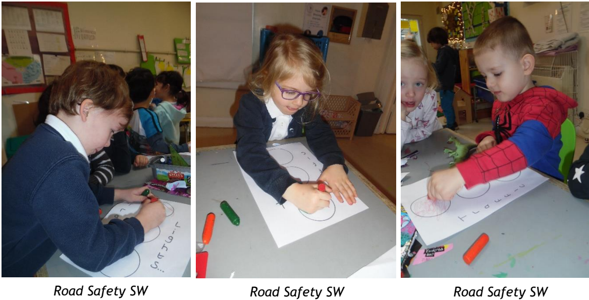
Road Safety SW Road Safety SW

Chloe - "You push the button and hold hands" Libby - "you don't stand in the road, you will be squashed by a car" James - "Orange means you can start your engine"