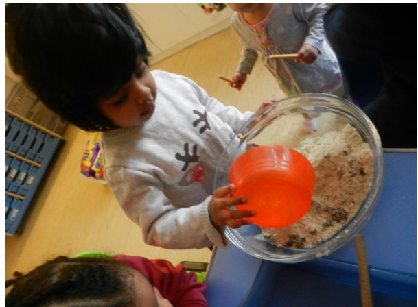
Welsh Cakes GH