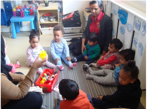
Song Box GH