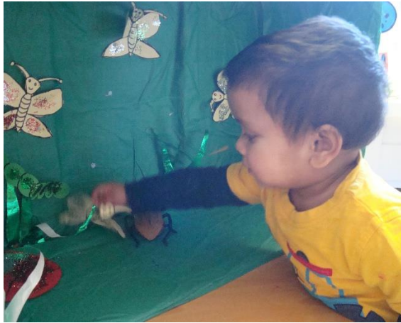
Garden Box GH