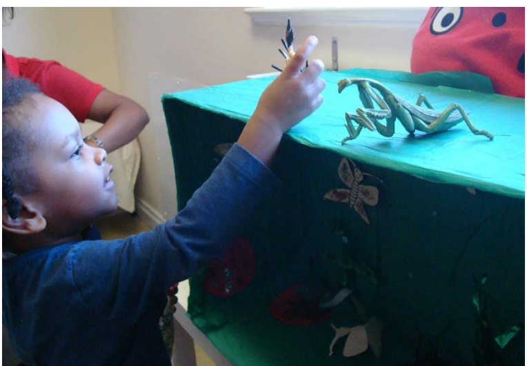
Garden Box GH

Rainbow Fish children in South Woodford have been exploring the sand. They have been using a variety of containers and spending time filling and emptying the containers. They have been exploring the grainy texture of the sand and some children enjoyed this so much that they climbed in the sand tray!! This has helped to develop their fine motor skills and the ability to listen to instructions.