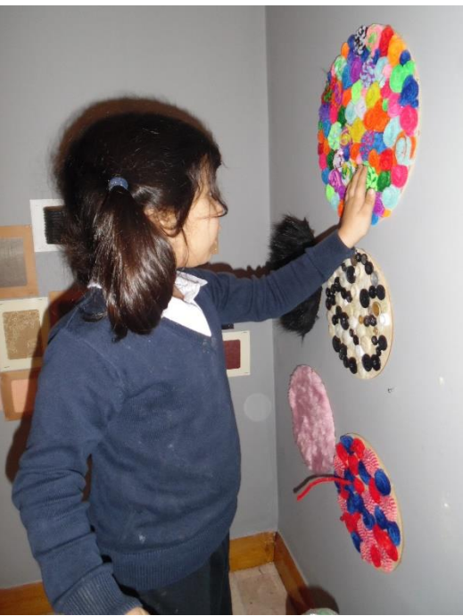
Sensory Room SW