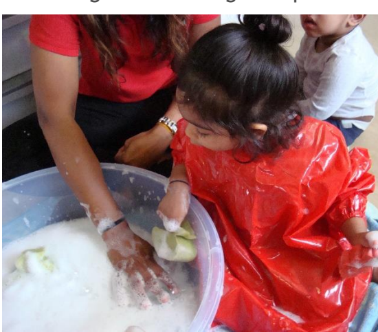
Water Play GH