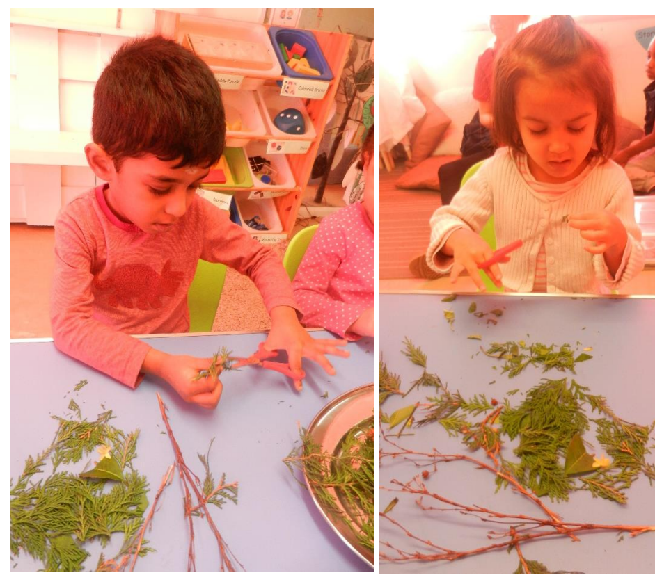
Sensory Tray GH