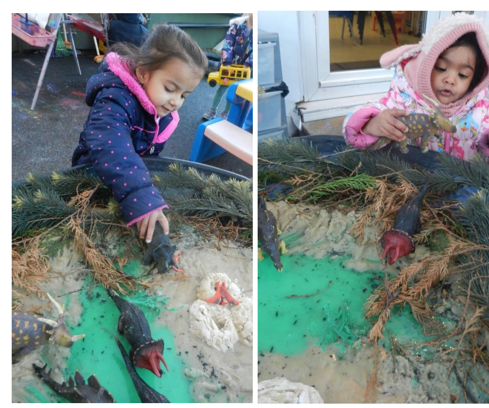
Dinosaur Swamp GH