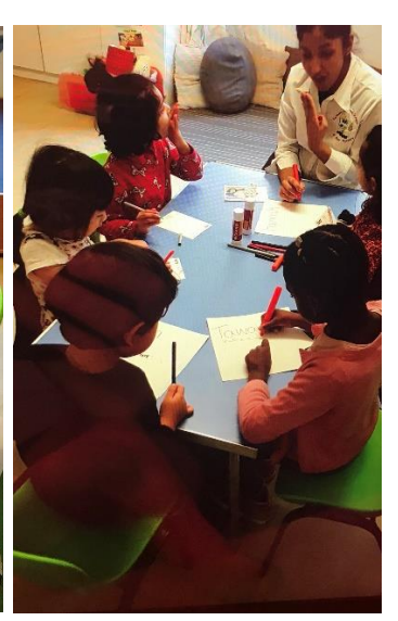
Postcards GH Postcards GH Postcards GH